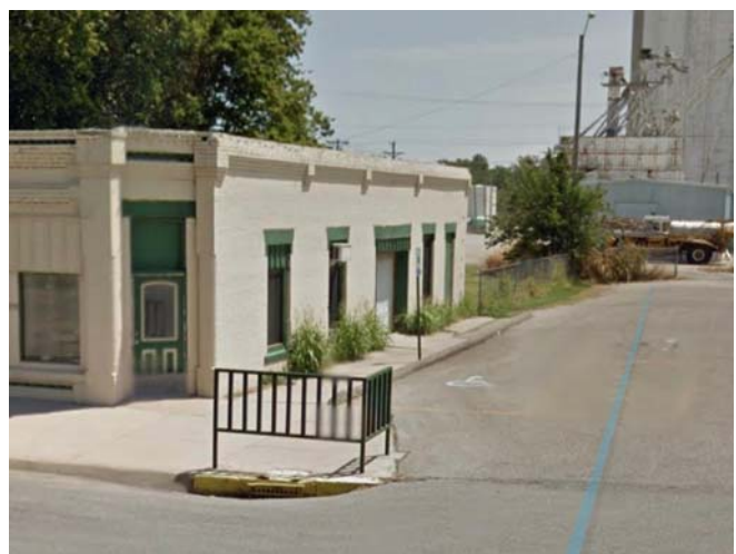
219 W. Main (photo taken prior to remodel work)