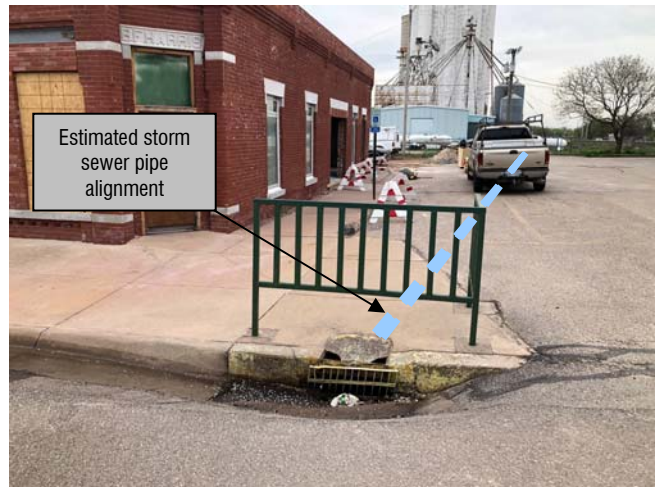
219 W. Main (photo taken during the Empire Taco building remodel in 2019)

In February of 2024, staff direct the City Engineer to move forward with bidding the project. Bid documents were completed in April and the project was placed on hold until after the 2024 Old Settlers Festival. Bid advertisements were distributed to prospective bidders on July 16 th and on August 13 th the project was bid. Following is a summary of the bids received: