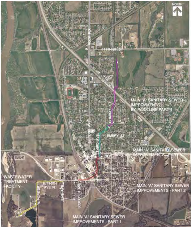
Main “A” Sanitary S ewer Improvements - Project Phasing Map

Following is a tentative time-line for Phase 3: Notice of Award..... Dec. 2, 2024 Approve Const. Agreement..... Dec. 16, 2024 Notice to Proceed (30-day late start)..... Jan. 15, 2025 Complete Phase 2 Main A Improvements (120-calendar days)..... May, 2025